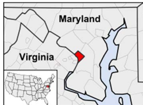
Location of Washington D.C.