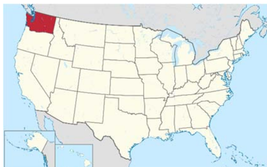
Location of Washington