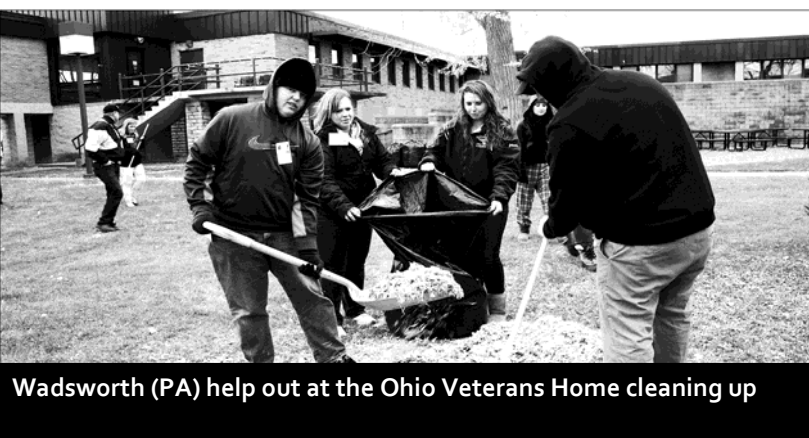
Wadsworth (PA) help out at the Ohio Veterans Home cleaning up